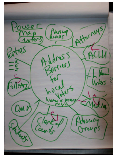
Power Map: Assisting local voters if Voter ID Bill passes