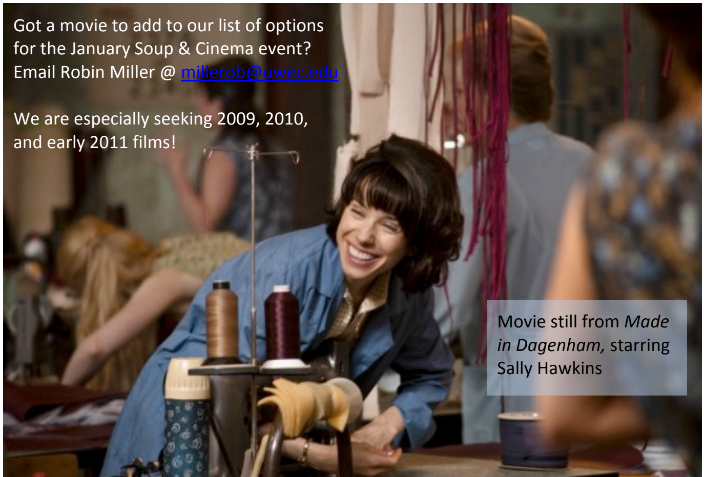
Movie still from Made in Dagenham , starring Sally Hawkins

We are especially seeking 2009, 2010, and early 2011 films!