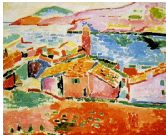
Henri Matisse's Les toits de Collioure