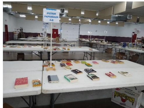
Paperback Fiction – After

For those of you who did not have the opportunity to see the tables at the end of the book sale, the above pictures indicate why we had such a successful sale and had to take so few boxes of books to Savers.