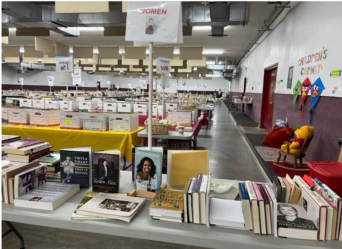
View from the Front