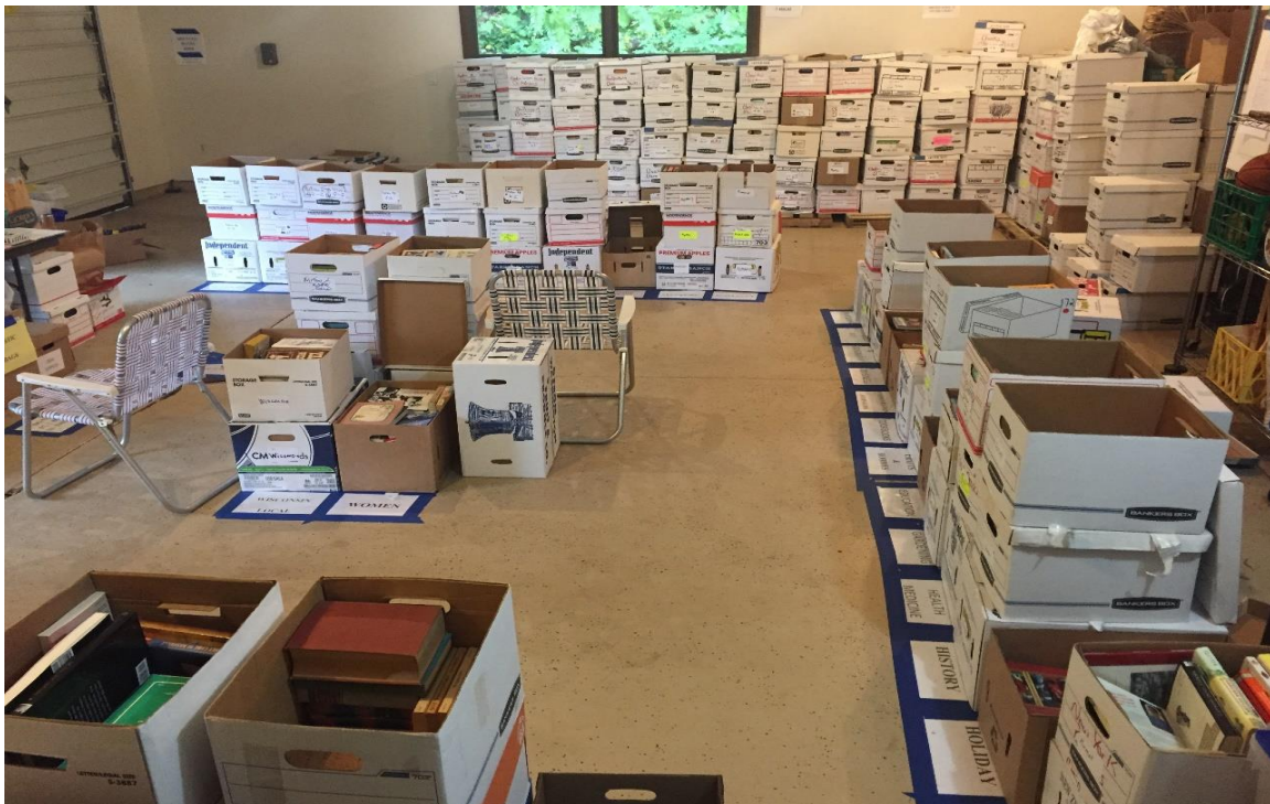
Helland's Garage –Impressive sorting area