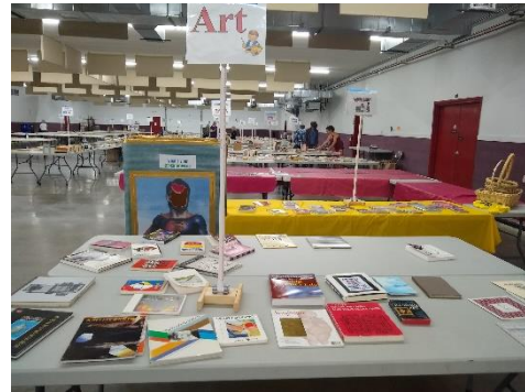
Art – After