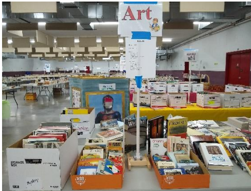
Art – Before